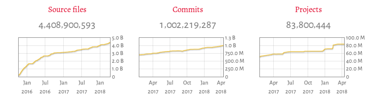
Figure 1: Growth of the Software Heritage archive, as of April 2018

elicit from them a set of requirements for the Software Heritage identifiers.