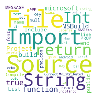
Fig. 2. Word cloud for token frequency distribution.